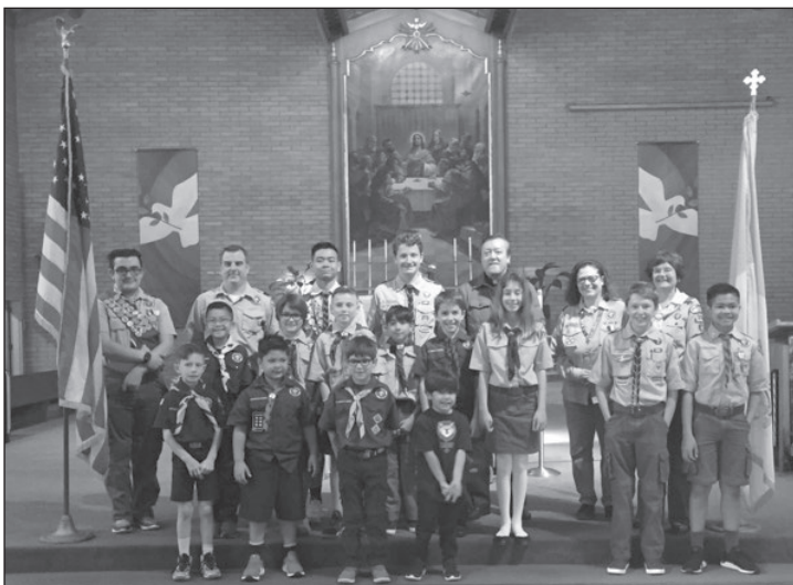
On Feb. 2nd, 2020, SFC celebrated Scout Sunday. Pictured here are some of our participating scouts, including members of SFC Cub Scout Pack 334 and Eagle Scouts from Troop 390.

The Adoration Chapel will be opened after Daily Mass and will be closed at 6:00 pm. Every Sunday in observance of the Lord's Day, the Adoration Chapel will be closed from 4:30 pm Saturday until Monday after the Daily Mass.